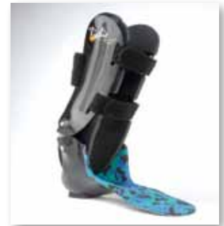
Custom molded orthotic foot plate