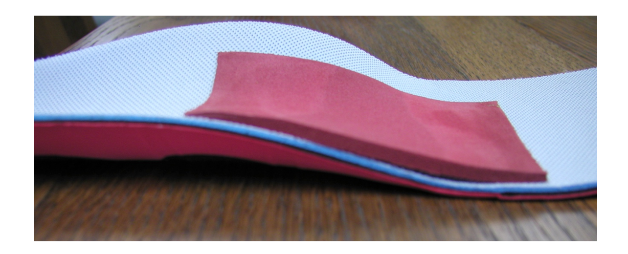
Figure 1: Photo of the Richie ArchLock placed on a right shoe insole